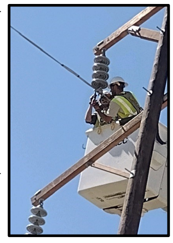
Two MPPD apprentice lineworkers hang line on a transmission structure that went down during the storm.